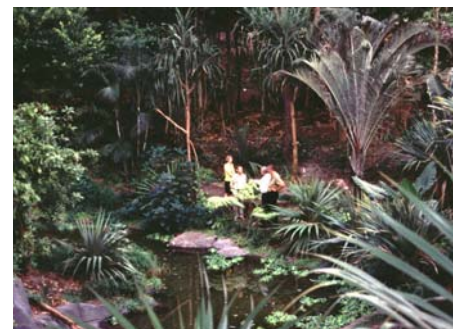
Integration, Masoala Hall, Zürich, 2003