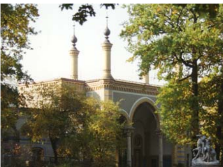
Giraffe house in oriental style, Berlin, 1872

The recent development in zoological institutions is characterized by fundamental changes: Modern zoos offer enclosures meeting behavioural requirements of animal species. Today enclosure design resembles natural habitats and is integrated into the entire architectural concept of zoological gardens. This offers an optimal platform to inform visitors about wildlife in a comprehensive manner. Zoos focus more and more on research and education, thus they have become valuable centres for nature conservation.