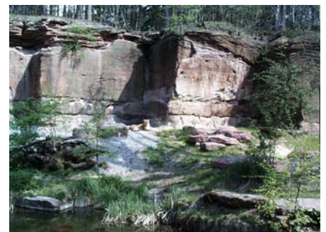
Landscape zoo, Nuremberg, 1939