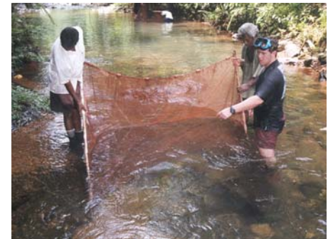
The joint IUCN/Wetlands International Freshwater Fish Specialist Group is chaired by the Director of Chester Zoo

Professional associations are effective instruments in achieving improvements in zoos and aquariums. Zoo associations must develop a consciousness for conservation that unites the activities of its members within an ethical and technical framework.