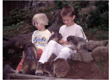
Close encounter with Alpine marmots at Argelès Wildlife Park (France)

The major goal of zoos and aquariums is to protect and secure endangered species and ecosystems. To achieve this goal they contribute to nature conservation by being part of global conservation actions and they promote the link between their conservation activities and their work routine to gain public support.