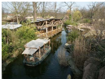
Adventure park elements, Hannover, 2000