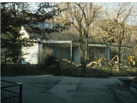
Functional architecture, Basel, 1956