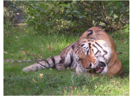
Siberian tiger at Bronx Zoo (USA) busy with a cattle bone

Zoos and aquariums follow ethical principles and maintain highest standards in wildlife management and breeding which usually exceed legislation standards. The Code of Ethics adopted by the members of WAZA is the common ground on which nature conservation activities are based. Breeding actions should not affect animal welfare.