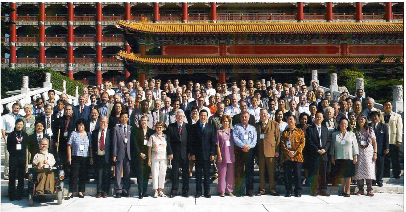
Delegates at an Annual Conference of WAZA

1300 zoos and aquariums worldwide. These institutions have more than 100.000 employees and are hosts to more than 600 million visitors each year, approximately 10% of the world's population. This gives the WAZA access to larger number of visiting public, more than any other group of public, conservation-oriented institutions.